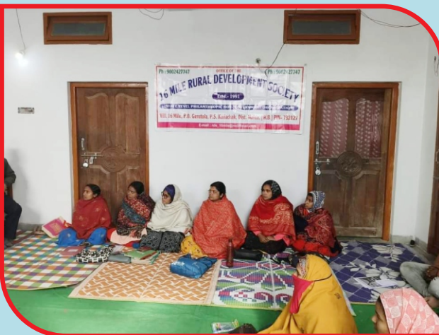
Project co-ordinator & FF Training Program

2.5 SOCIAL INVESTING REPORT (SIR):- This is a government procedure Missing children's are found and then a formal enquiry is being done by the district social welfare officer at district. In this In this case, District Social Welfare department of Malda asks this organization to enquired of the residence of any missing child found or Kept of that particular child and other information about the child and his or have family. He preparer a rq xxxx in prescribed form and submitted to the district social welfare officer, Malda. This organization has prepared such 79 social investigation report so far.