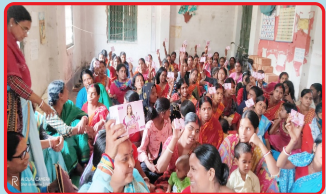
Awareness camp for family planing