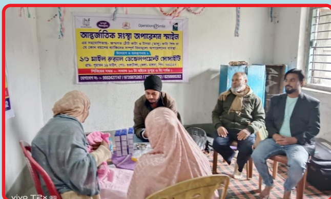
Counseling camp for Lip & Pallet Patients

1.5 AWARENESS PROGRAM ON DRINKING WATER:- In Kaliachak-III blocks main source of drinking water is arsenic free pipeline supply through PHE and household tube wells. There are many water tanks with multi tap connection are installed in almost every village. But it is found that most of them are not usable due to loss of taps and some taps are not in order, resulting wastage of purified drinking water. So, awareness programme were conducted with villagers to take care of such tanks and taps, remove, the broken one so that wastage of water can be presented.