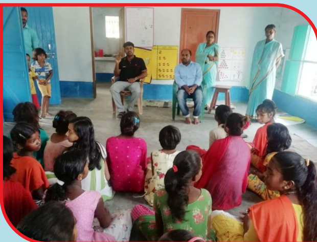
Awareness Program on Child marriage