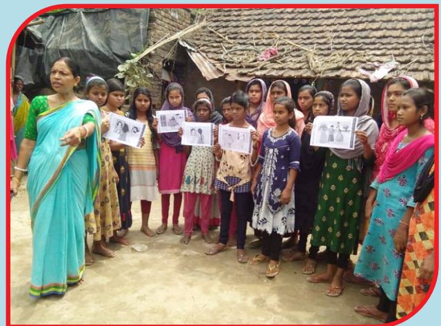
LGG Session for Adolescent Girls