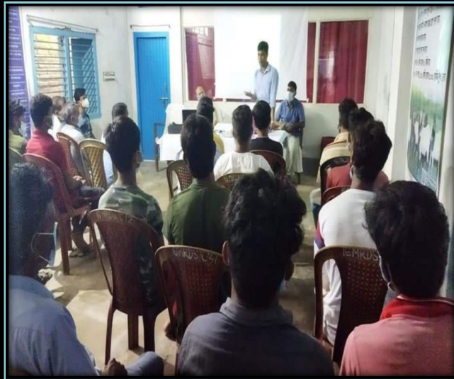
Training in fish farming is being given to the unemployed youth to make them self-reliant at 16 Mile