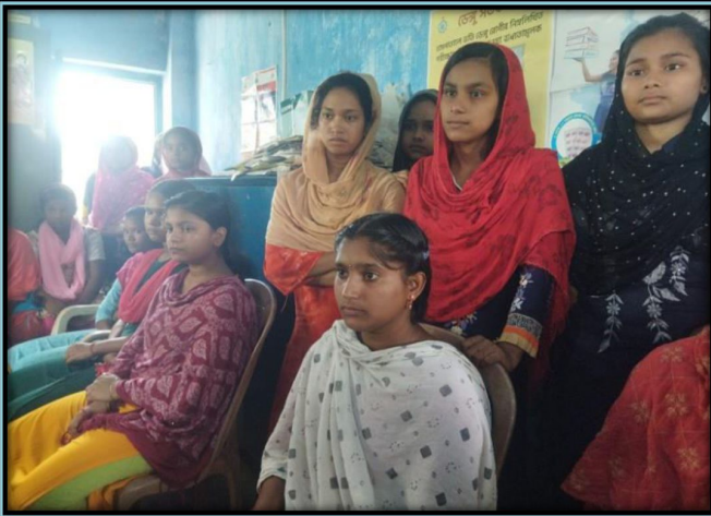
Celibration Programme on Dewarming Day