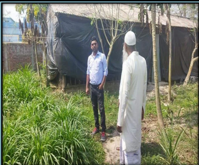
Visiting of hybrid naiper seed production Central at Kamat by CDPO, Kaliachak-III ICDS Project, Malda