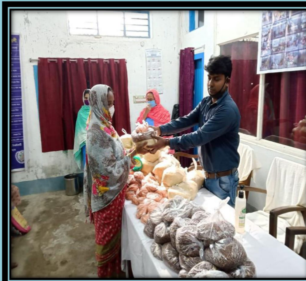
The CDPO Kaliachak –III, MaldaTHR hand over the Children of the creche to the mothers.