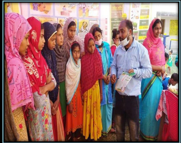
Vesetable seeds distribution for adolescent Girls under SKCP Project at Kaliachak-III ICDS Project, Malda