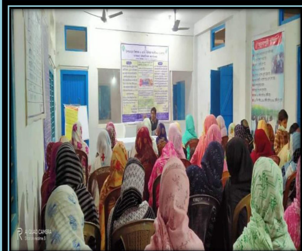
Consumer Awareness Program on SHG women at 16 MRDS Hall, Malda