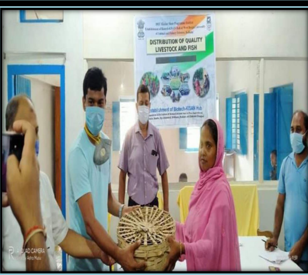
Distribution of Chickens by Biotech-Kishan Hub, Kolkata