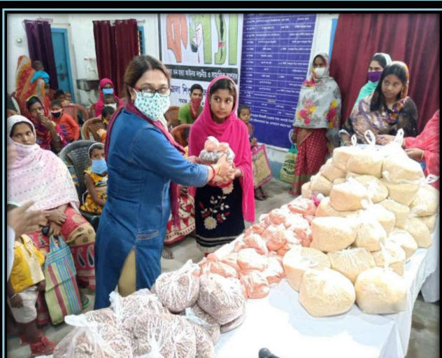
The Supervisor Kaliachak –III ICDS Project, Malda THR hand over the Children of the creche to the mothers.