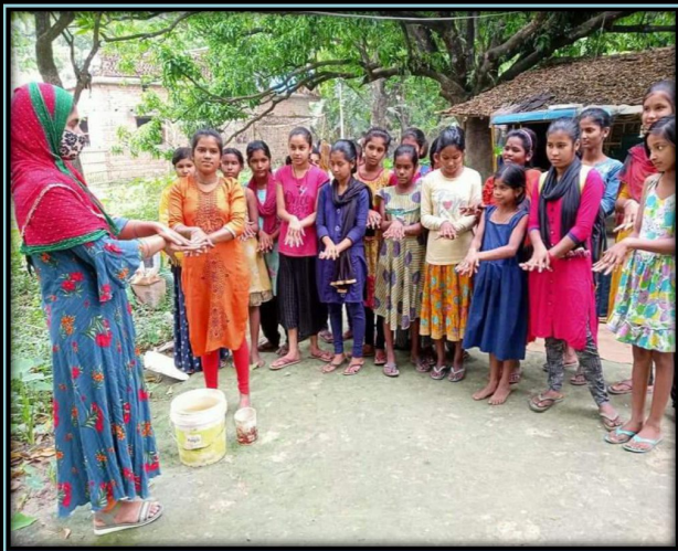
Handwash program for Adolescent Girls in Kaliachak-II ICDS Project, Malda