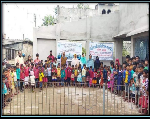
Observation of child protection week-2021-22 with Creche Children at 16 Mile, Malda