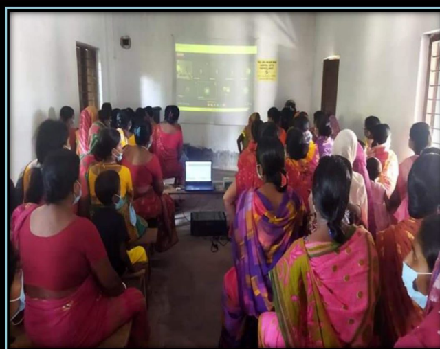
Goat rearing training is through online under Biotech Kisan Hub, Kolkata