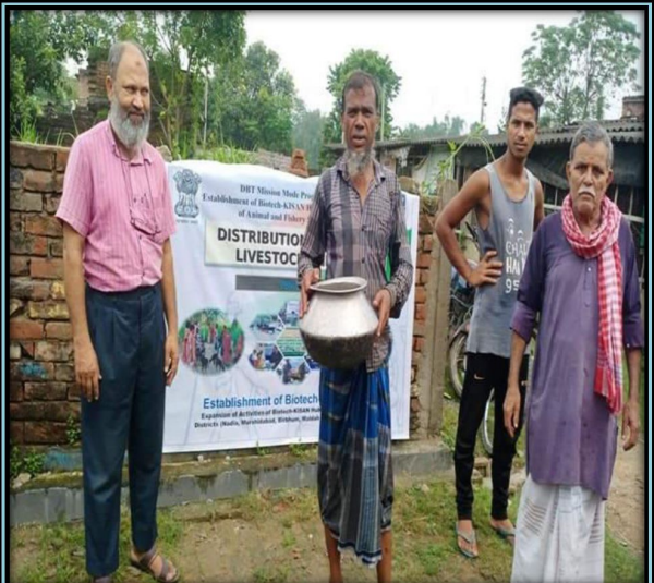
The Secretary of 16 Mile Rural Development Society is handing over the fry to the fish farmers