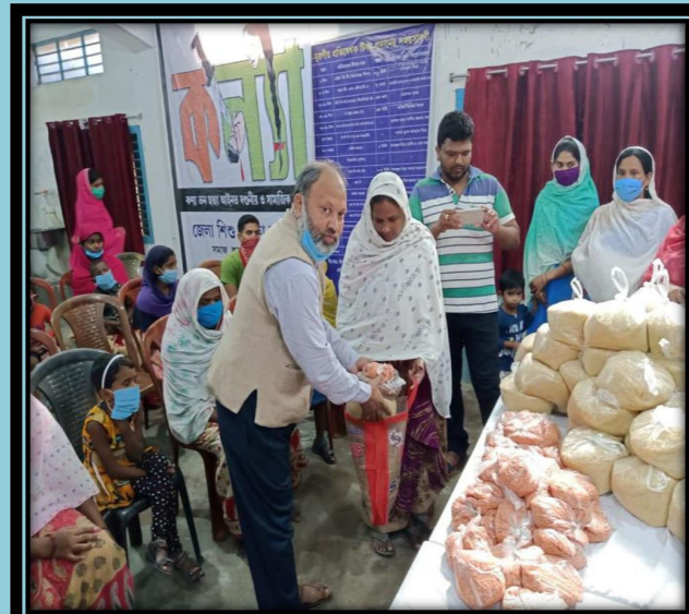
The Secretary, 16 Mile Rural Development Society, Malda THR hand over the Children of the creche to the mothers.