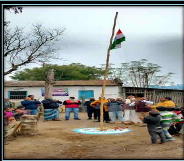
74 th Independence Day Celebration held by Society