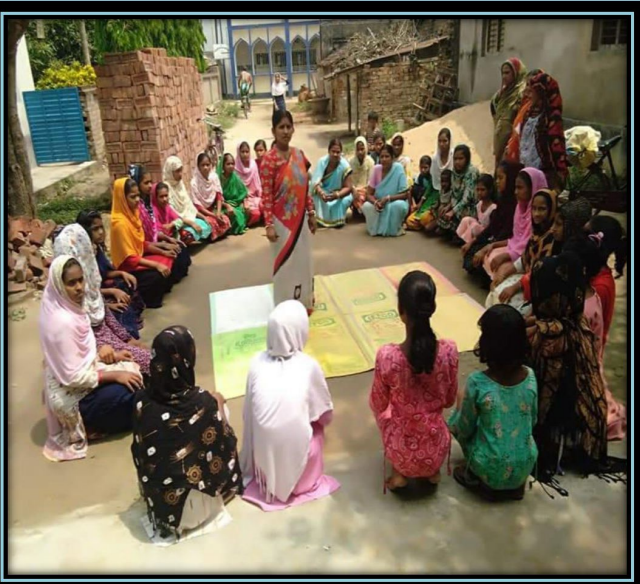
Awareness Program with Adolescent Girls through game at Kaliachak-III Block, Malda