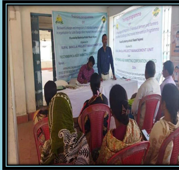
Sufal Bangla Awareness Camp is about the real farmers of the village in Kaliachak-III Block, Malda