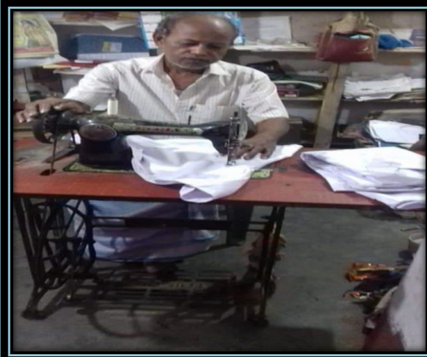
Tialoring Hub at Kumbhira in Kaliachak-III Block of Malda district under REH Project.