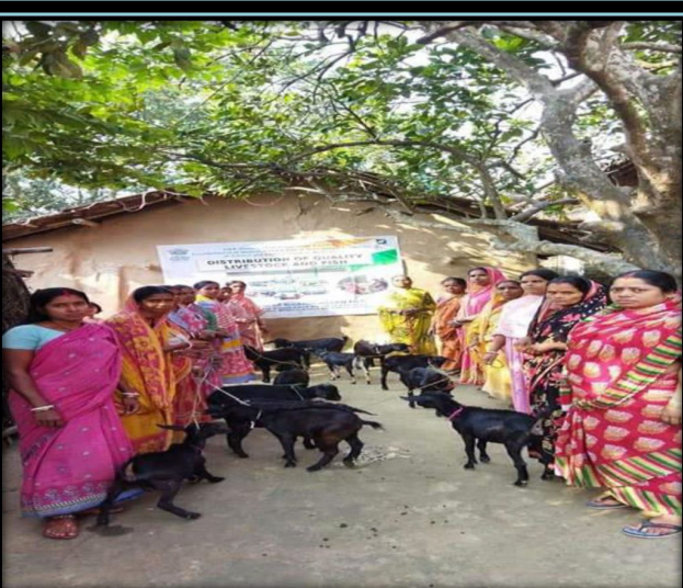
Black Bengal Goat distribution program to FPC members under Biotech Kisan Hub, Kolkata